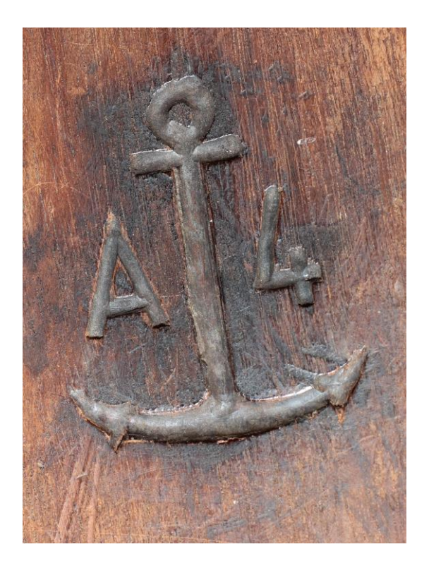
Penthièvre "A+4" inventory brand mark